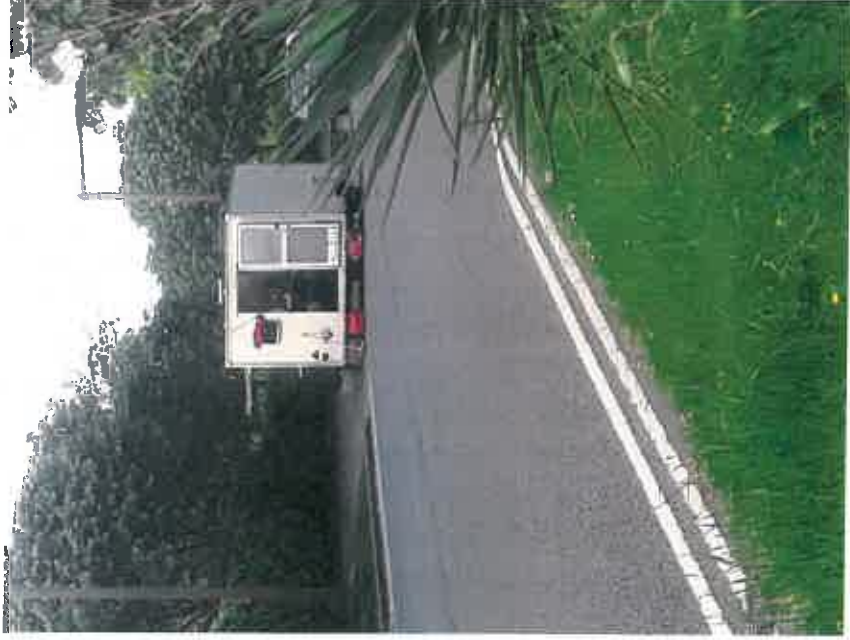
Photograph 1: Rear of trailer showing open sign on May 9 th 2020

Photographs taken of Shenley Kebabs on Roebuck Way, Knowlhill