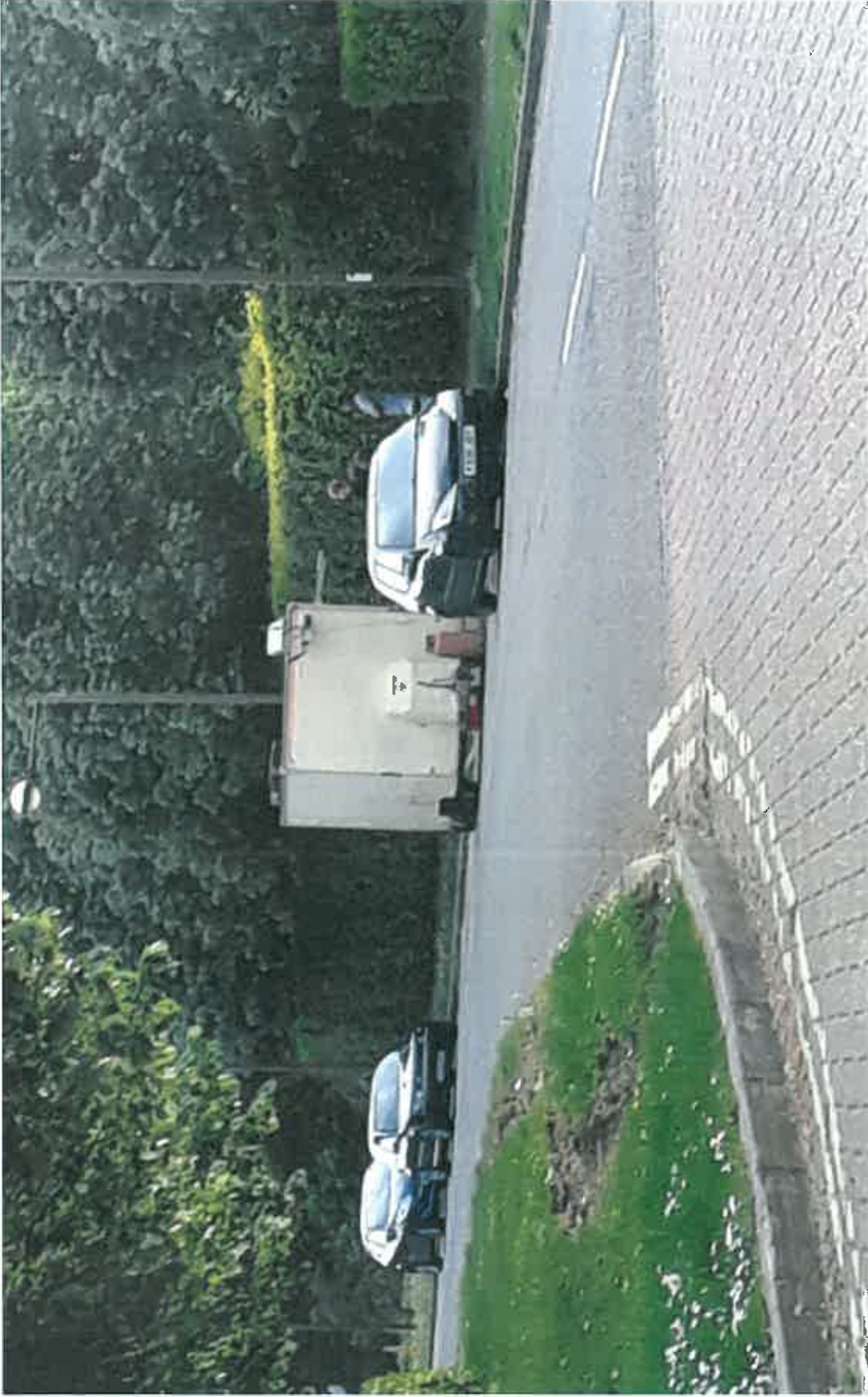
Photograph 2: customers waiting on May 9th 2020