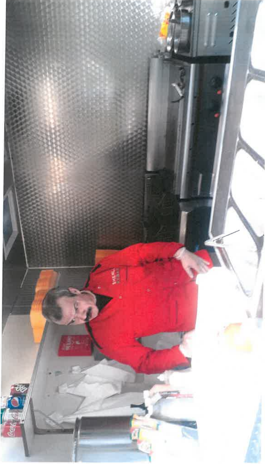
Photograph 7: Mr _____ on May 16 th 2020