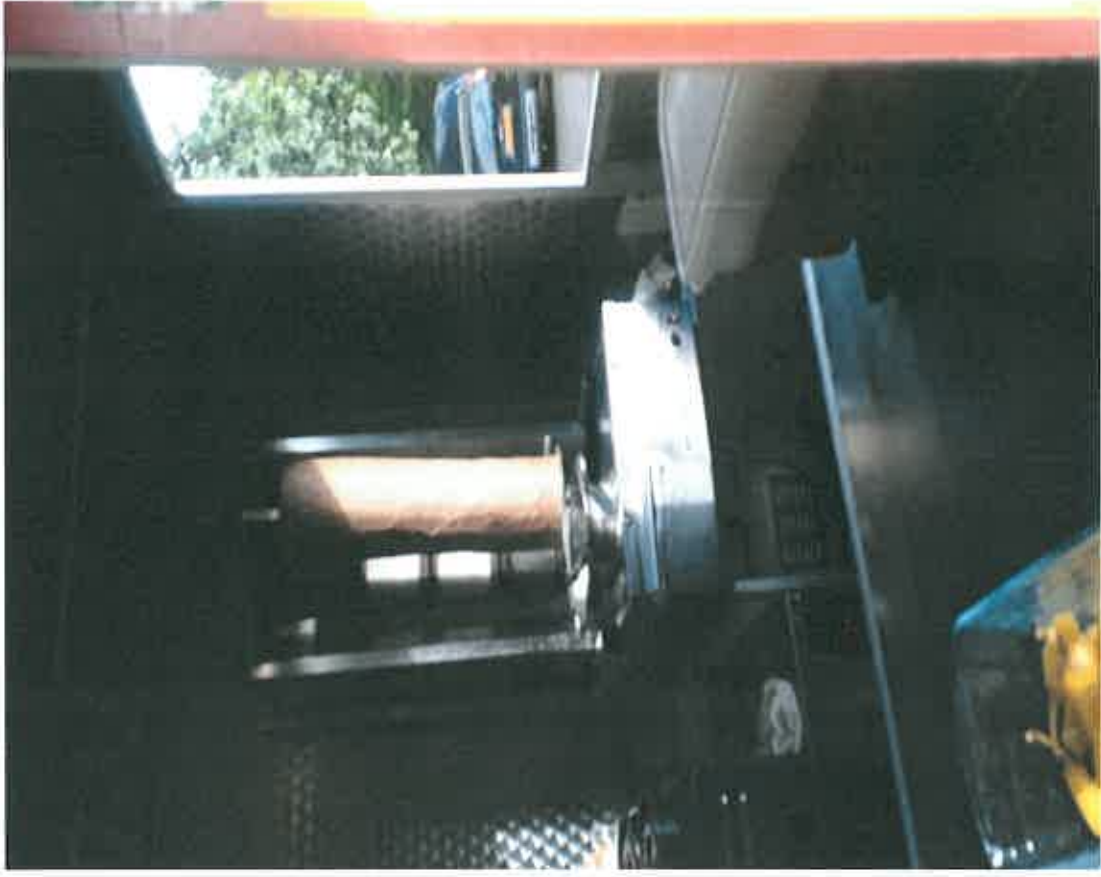
Photograph 8: Kebab on spit May 16 th 2020