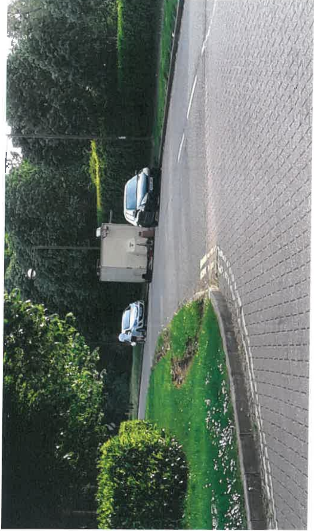
Photograph 3: Customers leaving with carrier bag on May 9th 2020