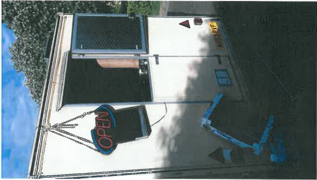
Photograph 6: Open sign on rear of trailer May 16 th 2020