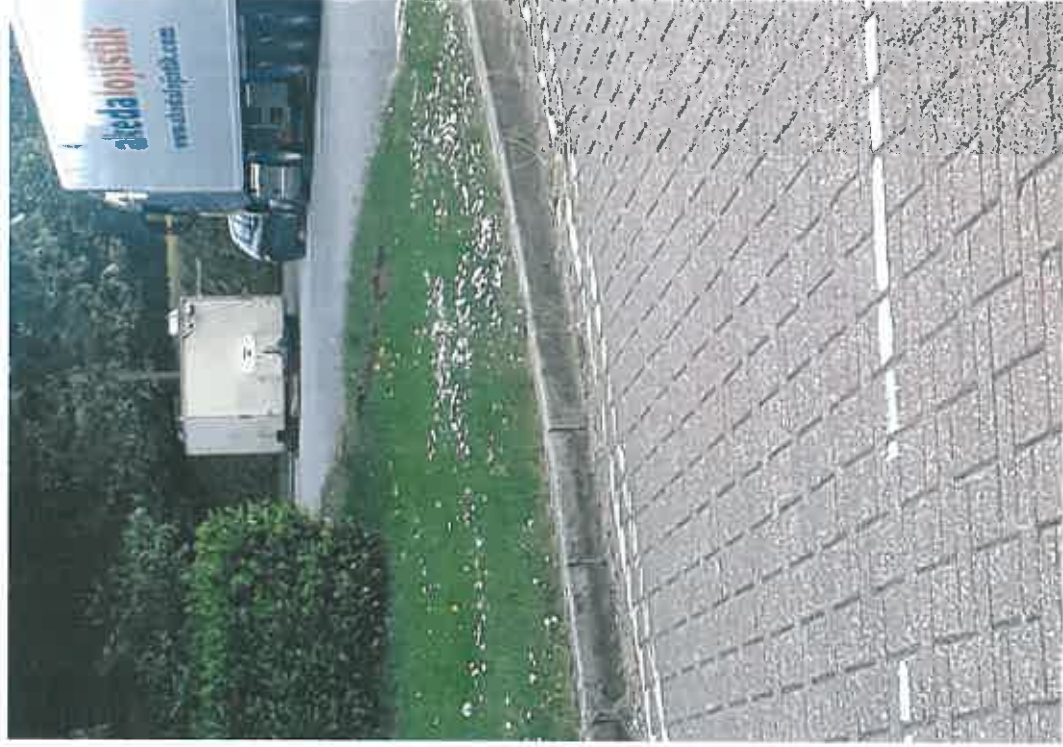
Photograph 4: Trailer in situ on May 16 th 2020