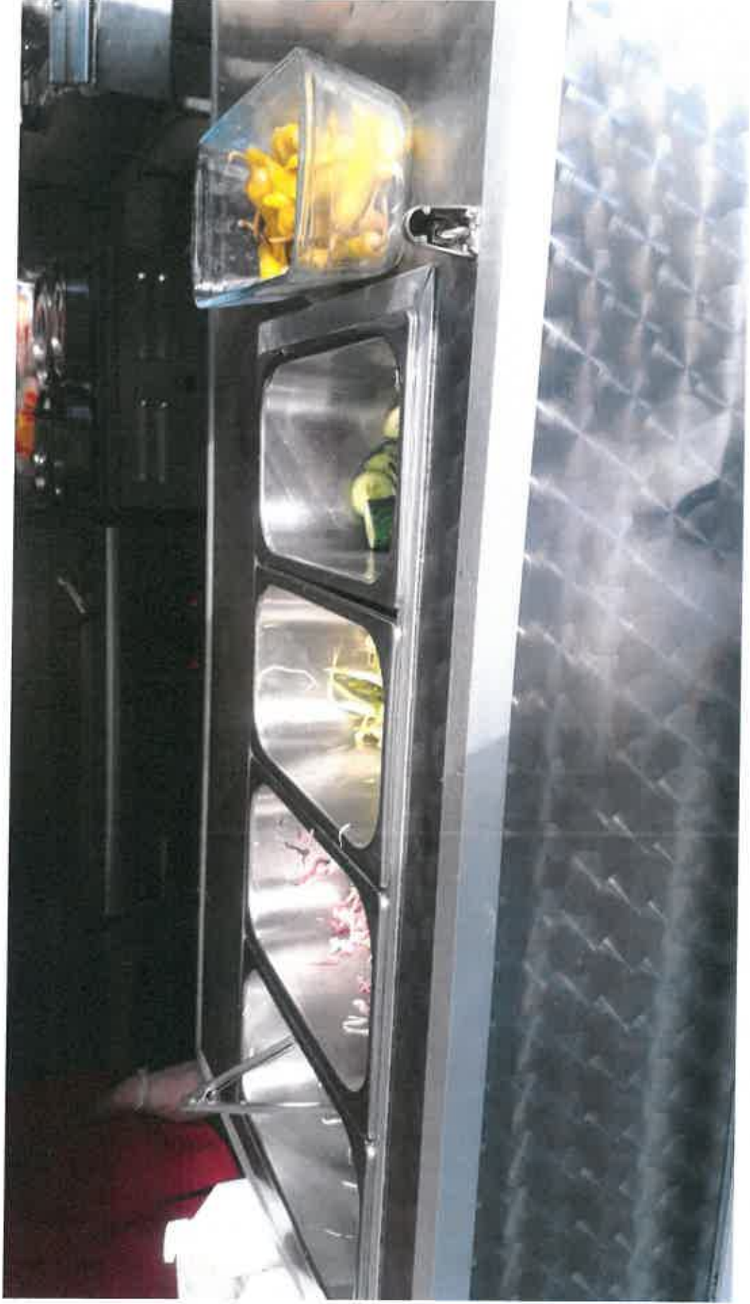
Photograph 9: Salad on display at serving hatch on May 16 th 2020