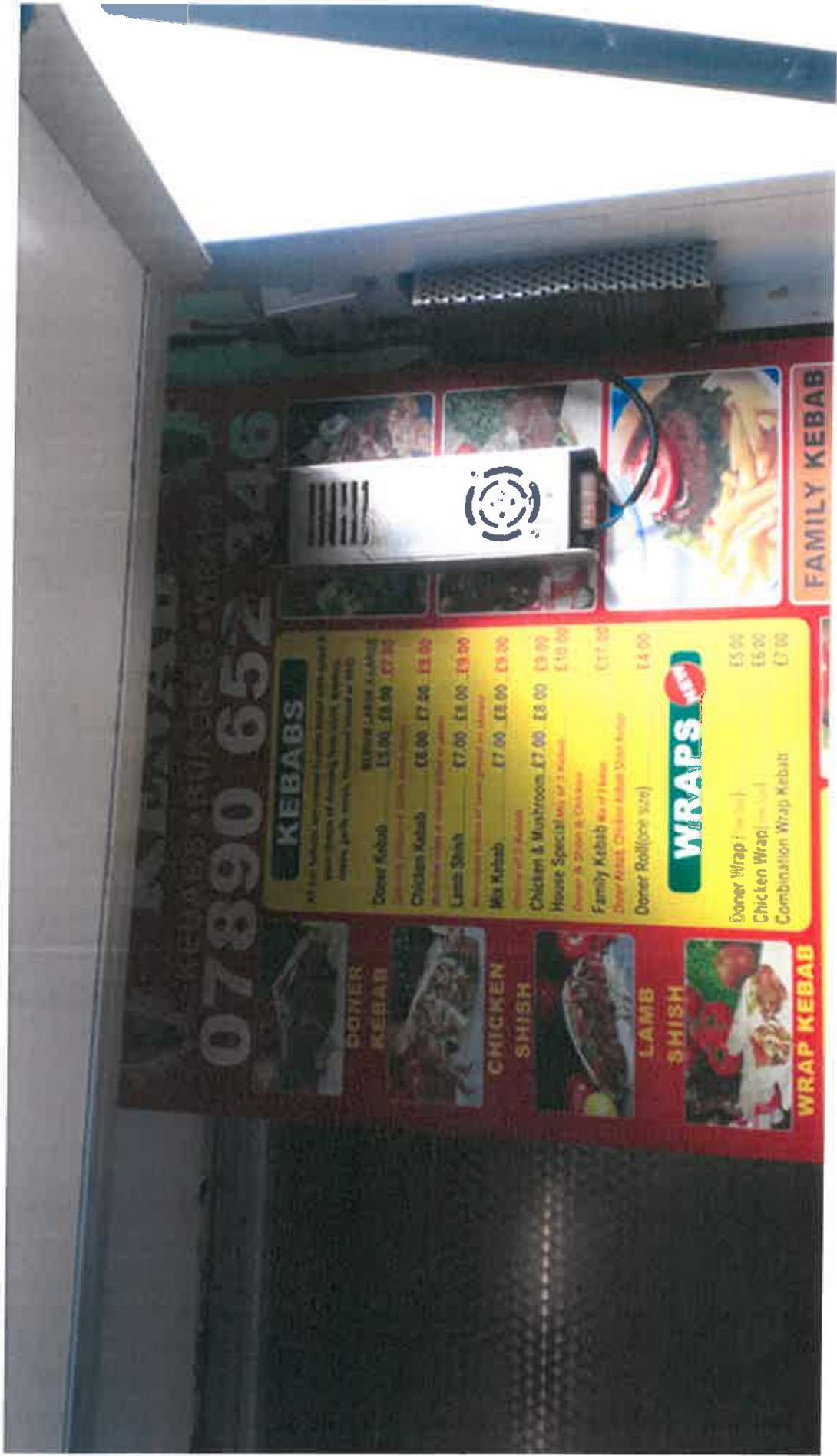
Photograph 5: Menu board on trailer May 16 th 2020